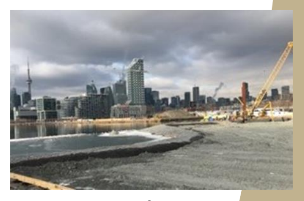
Toronto waterfront, Don River project filling - MECP, Jan. 2019